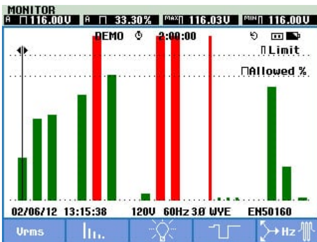
Power wave data capture

Advanced Power Quality Health —At-a-glance power quality health data in real-time so you have the data you need, when you need it