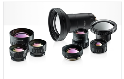
8 optional lens for maximum versatility.