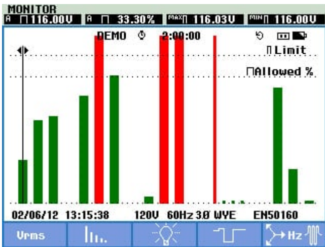
Power wave data capture

Advanced Power Quality Health— At-a-glance power quality health data in real-time so you have the data you need, when you need it